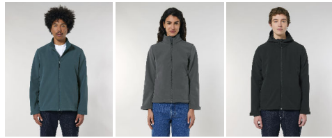
Stanley Navigator Stella Navigator Stanley Discoverer

Shell : Balanced Plain weave , 6% Elastane , 94% Polyester - Recycled , Fluorine-free DWR , 342 GSM